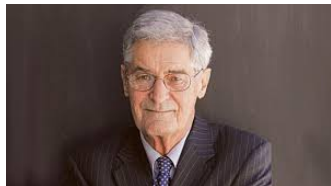
Robert E. Lucas (1937-2023)